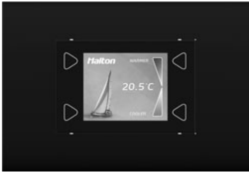
LCD control panel